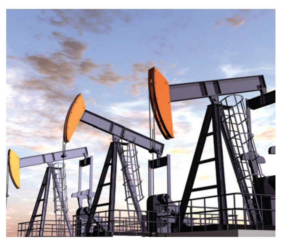
St Peter Port Capital made a major gain on HRT, a Brazilian oil explorer

As in previous years, we have calculated